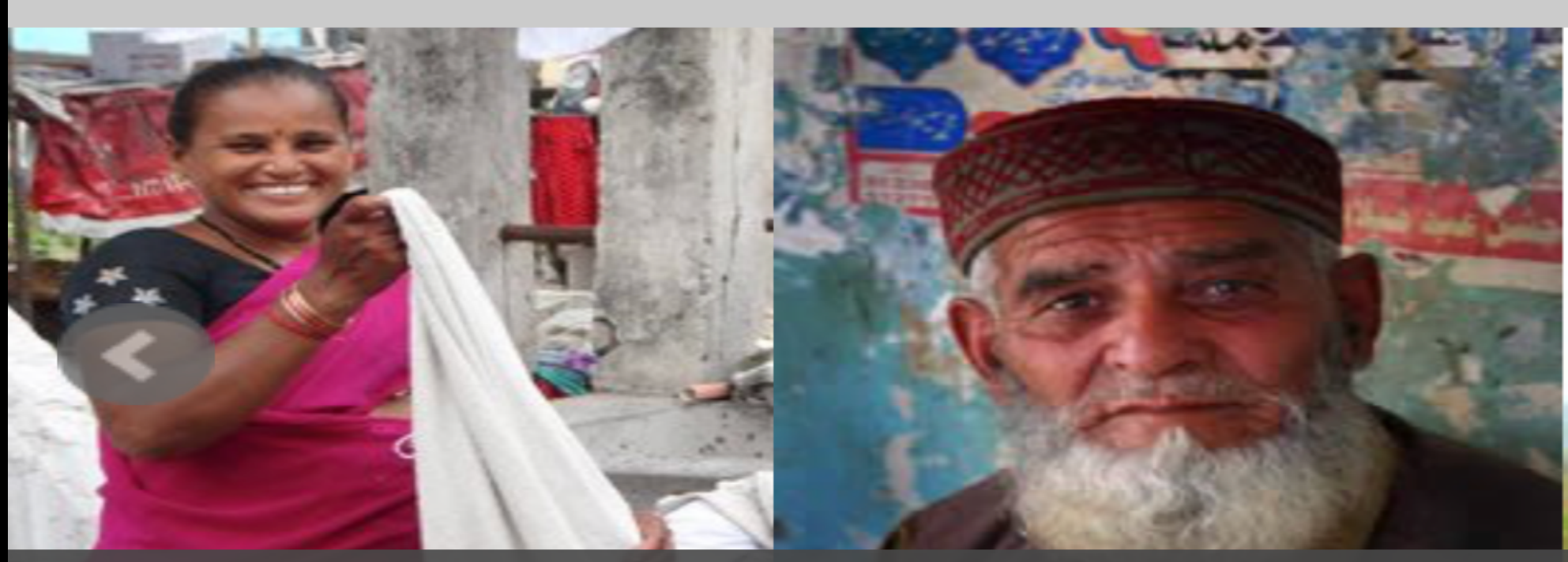
Dhobi (Hindu traditions) Jat (Muslim traditions) in in India Pakistan

Bringing definition to the unfinished task