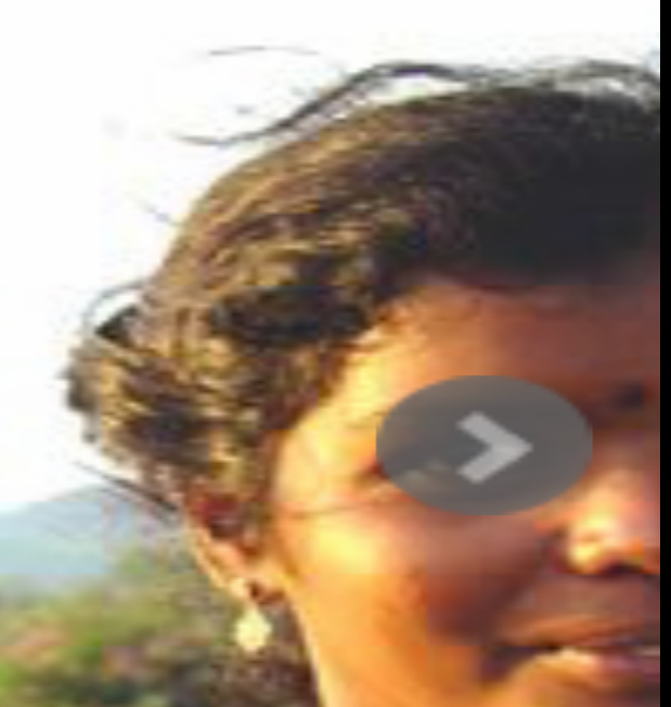
Madiga (H traditions) ir